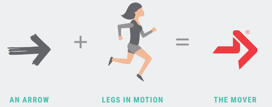
Represents physical activity